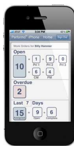
iPhone home screen