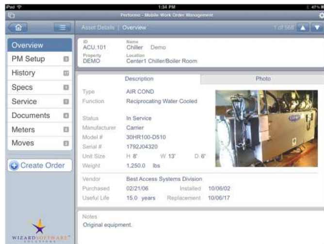
The Performo™ iPad asset detail screen