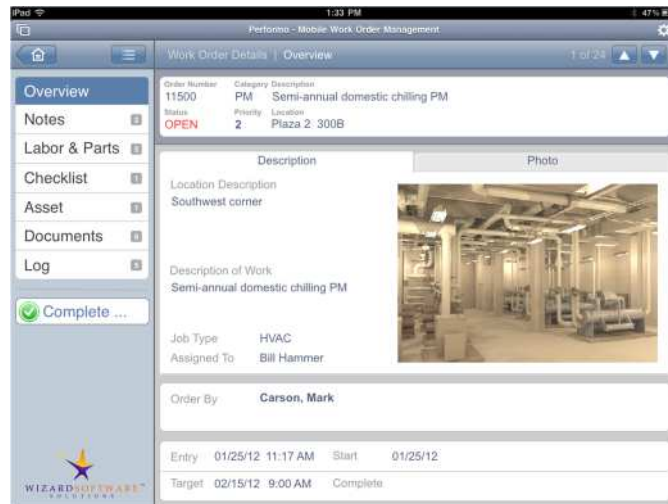
The Performo™ iPad work order detail screen