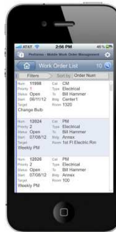
Work order list